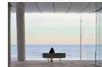
Mareterra – L'Anse du Portier Monte Carlo, Monaco RENZO PIANO'S ARCHITECTURE